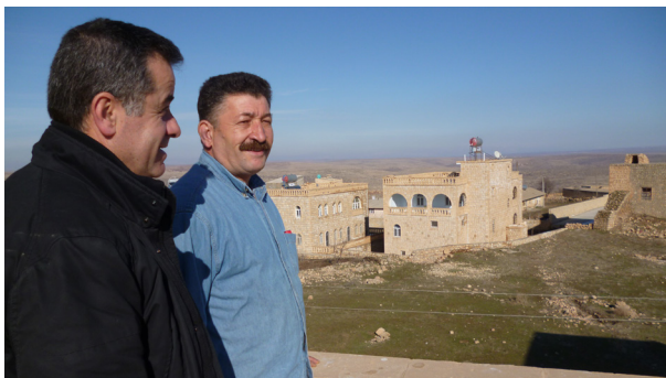
Diaspora Syrians living in the German towns of Augsburg and Göppingen survey their rebuilt houses in the village of Enhil.

The distinction is an important one: While the elderly simply wish to live out their old age in their childhood homes on their European pensions, the middle-aged are working to revive Syriac life in the region by re-establishing businesses, associations, families, and community life there. Consequently, time is now critical for a return of the Syrians. Year by year, as the last generation of Syrians born in Tur Abdin slips into old age, the window of opportunity for a return and for the preservation of the Syriac culture in its homeland is closing fast.