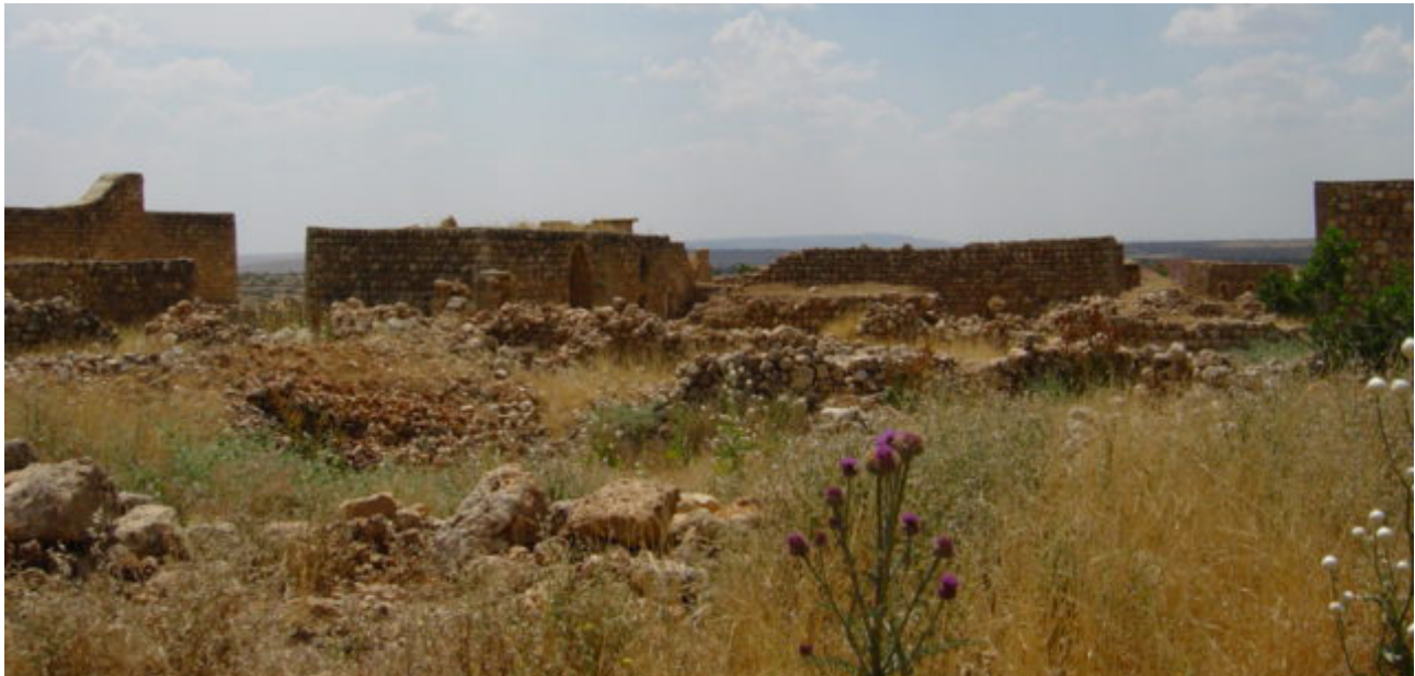
The village of Kafro in 2003: Forsaken, but not forgotten.

leadership of the church. But even as the debate rages, three elements remain central to the Syriac identity: the ancient faith and language, the ties to the land of Tur Abdin, and a deep sense of historical responsibility to safeguard them both.