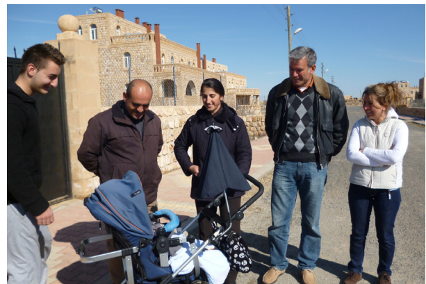
The village of Kafro in 2013: Villagers admire the first baby born in Kafro since their return from the diaspora.

Nevertheless, Syriac resurrection in Tur Abdin has continued to progress in some ways. Several abandoned monasteries, such as Mor Augin and Mor Yakup, have been reopened in the past couple of years and staffed with young monks returned from the diaspora. Other monasteries like Mor Gabriel and Mor Malke have been renovated, as have many ancient village churches. Returning Syrians have opened a factory producing wine in the biblical tradition in Midyat (no mean feat in a now conservatively Muslim town). 16 One returnee has started a Syriac monthly paper which is now in its fourth year - the first newspaper to be published in Aramaic in the history of the Republic. 17 Others have founded Syriac associations or run for office on the local level.