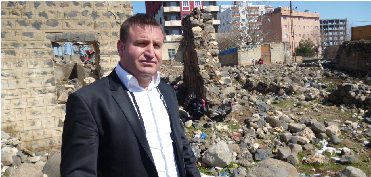
Syriac returnee from Germany in the rubble of his Christian hometown of Azakh, with the modern Kurdish town of Idil behind him.

As part of its bid to reinvent itself as a multi-ethnic democratic force, the Kurdish nationalist movement has also embraced the Syriacs. PKK leader Abdullah Öcalan has repeatedly called on his followers to forge an alliance with the Syriacs and support their return to the region, most recently in a letter from Imralı this year. 23 The HDP (formerly BDP) has fielded Syriac candidates on its election tickets, winning them representation at the municipal and district levels in Tur Abdin and even in national parliament, which a Syriac entered on the BDP ticket in 2011 to become the first deputy from this minority in the history of the Republic; he was reelected on the HDP ticket in 2015. However, the Kurdish party has not been able to translate its outreach policy into neighborly relations on the ground in Tur Abdin, where Kurdish attacks on Christians, land grabs, and intimidation are still prevalent even among the pro-PKK tribes and mutual distrust runs high. 24