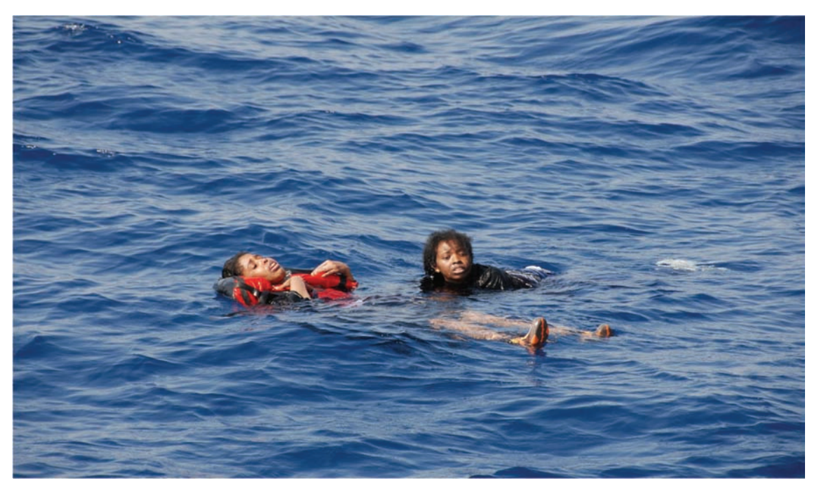
Migrants being rescued by the Hellenic Coast Guard in the Aegean Sea.

having 1,170 kilometers of porous land borders and 18,400 kilometers of coastline, including islands in close proximity to Turkey, Greek police and Coast Guard authorities are zealous in their efforts to prevent irregular entry. In 2007, Greek police recorded 112,369 arrests for illegal entry or presence. However, Human Rights Watch believes this is the tip of the iceberg. Many, perhaps most, of the apprehensions in the border region are not recorded at all.