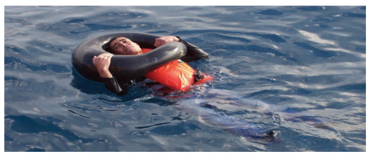
Migrant being rescued by the Hellenic Coast Guard in the Aegean Sea.

Although Human Rights Watch interviewed five migrants who were rescued and brought ashore by the Greek Coast Guard (some, but not all of those rescued also said that they were beaten or threatened with being shot), 10 other migrants told Human Rights Watch about uniformed guardsmen pushing them back into Turkish waters, puncturing their inflatable boats, as well as beating and robbing them. Another two migrants who the Greek Coast Guard returned to Turkish waters said that they had disabled their own boat.