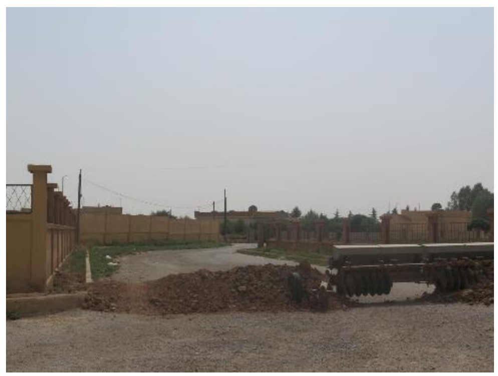
The entrance to Hammam al-Turkman blocked by a barrier placed by the Autonomous Administration, 30 July 2015.

In the nearby village of Hammam al-Turkman residents were gathered into the local school by the YPG and told they had to leave the area.