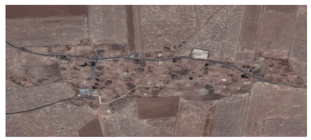
Satellite image of the village of Husseiniya taken on June 2015 reflects that almost the entire village has been razed.

Residents said that the village came under the control of the Free Syrian Army (FSA), an armed opposition group, in February 2013. A local Arab official from the Tel Hamees countryside said that the YPG first clashed with the FSA and other non-state armed groups in the Tel Hamees countryside in December 2013, and that the biggest confrontation between the FSA and the YPG took place in the village of Husseiniya in February 2014.3 The official said that at that time, a number of armed groups, including Ahrar al-Sham, Liwa' 114,