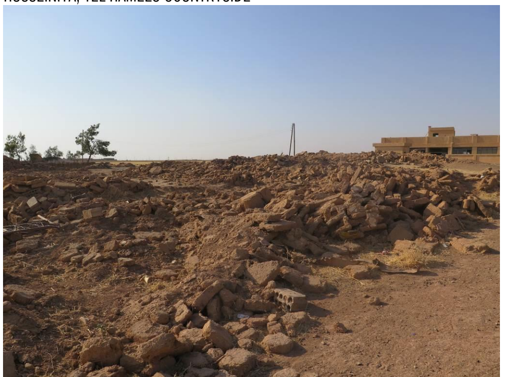
Some of the homes that were demolished in the village of Husseiniya.

Amnesty International visited the Arab village of Husseiniya in the Tel Hamees countryside in early August 2015. Villagers told Amnesty International researchers that nearly 90 homes in the village had been demolished, leaving only a single home still standing, and Amnesty International researchers saw the ruins of the destroyed homes during their visit. Satellite imagery of the village of Husseiniya taken in June 2014 and June 2015 analysed by Amnesty International reflect that 225 buildings were standing in 2014, but that only 14 remained in 2015, a 93.8% reduction in one year. The destruction reflected in the satellite imagery is not consistent with shelling but rather the demolition of the village. Residents said the YPG carried out the demolitions in February 2015, displacing most residents to nearby villages and to the city of Qamishli. Some Husseiniya residents remained in the village, living in a school that had not been destroyed.