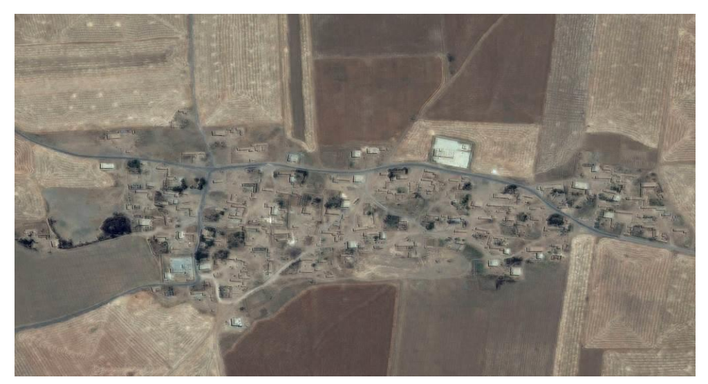
Satellite imagery the village of Husseiniya taken on June 2014.