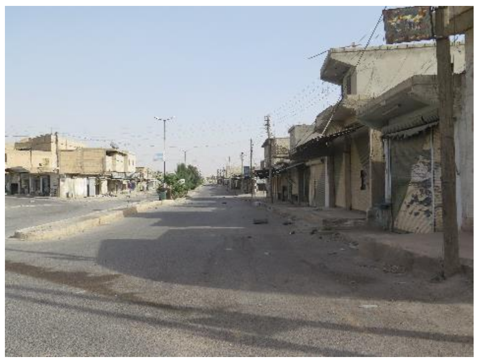
The town of Suluk to which residents have not been allowed to return, 30 July 2015.

A 91-year-old man from al-Ghbein who suffered from heart disease complained to Amnesty International that the YPG told him he had to leave the village, which was cut off from electricity and water. He said that he wanted to travel to Turkey where his wife and children were living, but that he was denied entry three times at the border. "I am hungry and thirsty," he said. He had nowhere else to go.<sup>51</sup>