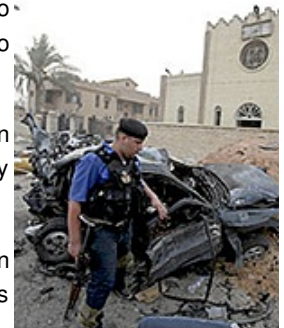
Several people were killed in a bombing aimed at christians on the 13th of July.

The security situation in Iraq has vacillated since the USA-led invasion of 2003. This year, on the average, ten civilians are violently killed every day, which makes it one of the world's deadliest conflicts in one of the world's most brutal countries.