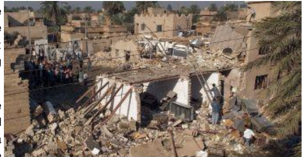
Debris from the car bombing of St. George Church in Baghdad (2004)

The primary focus of the community's concerns now centers on the deteriorating security situation of the Assyrian (also known as Chaldean and Syriac) Christians in the Dora neighborhood of Baghdad. The Dora neighborhood lies 10 kilometers southwest of Baghdad. Prior to the war, the predominantly Christian neighborhood was home to over 5000 Christian households. Since the war and the subsequent insurgency, the overwhelming majority have fled the area.