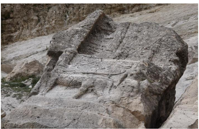
The winged Lamassu. Bullet holes can clearly be seen.