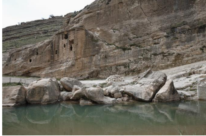
A sculpture of the Assyrian Lamassu, a winged bull, lies neglected on the riverbank after being blown up

Another example of changing the culture in northern Iraq to a Kurdish one is an archaeological site near Khinis (also called the Gomel Gorge). This cultural heritage site was built around 700 BC by the Assyrian king Sennacherib. On the cliff-faces are reliefs, inscriptions and sculptures which date from that era. A few years ago the ruins were blown up. Observers have indicated that Kurdish militias regularly used to practice their shooting on this important cultural heritage site.<sup>7</sup>