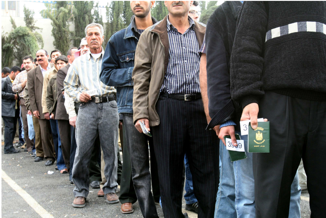
Iraqi refugees wait at a UNHCR office, near Damascus, Syria to register their names for residence, © Bassem Tellawi/AP/PA Photos, 23 April 2007

recent estimates suggest people are fleeing at faster rates than ever before. UNHCR recently predicted the number of newly displaced to be near 2,000 a day, equivalent to 80 an hour (day and night). 9