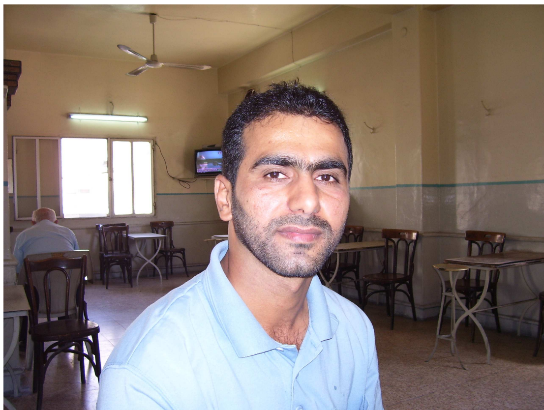
An Iraqi human rights defender from Basra, recognized by UNHCR as a refugee and awaiting resettlement from Jordan to Australia, © AI, Amman, September 2007

Australia has taken approximately 2,000 Iraqis a year over the past five years, and Amnesty International hopes the authorities will maintain this policy but increase its