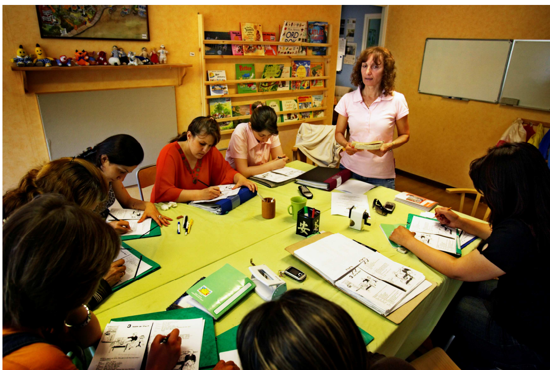
Iraqi refugees learn Swedish at a school in Södertälje, Sweden, © Panos Pictures, June 2006

As highlighted above, Amnesty International currently opposes all forcible returns to any part of Iraq. As such, in order to avoid a situation whereby individuals that reach the end of the asylum process become destitute and as such may be compelled to leave the host country due to the inability to meet their basic daily needs such as shelter, food and healthcare, rejected Iraqi asylum seekers should receive financial support and accommodation if needed with the same entitlements and rights as provided during the asylum process; be given permission to work; full access to health care, all levels of education and right to claim benefits until their situation is resolved.