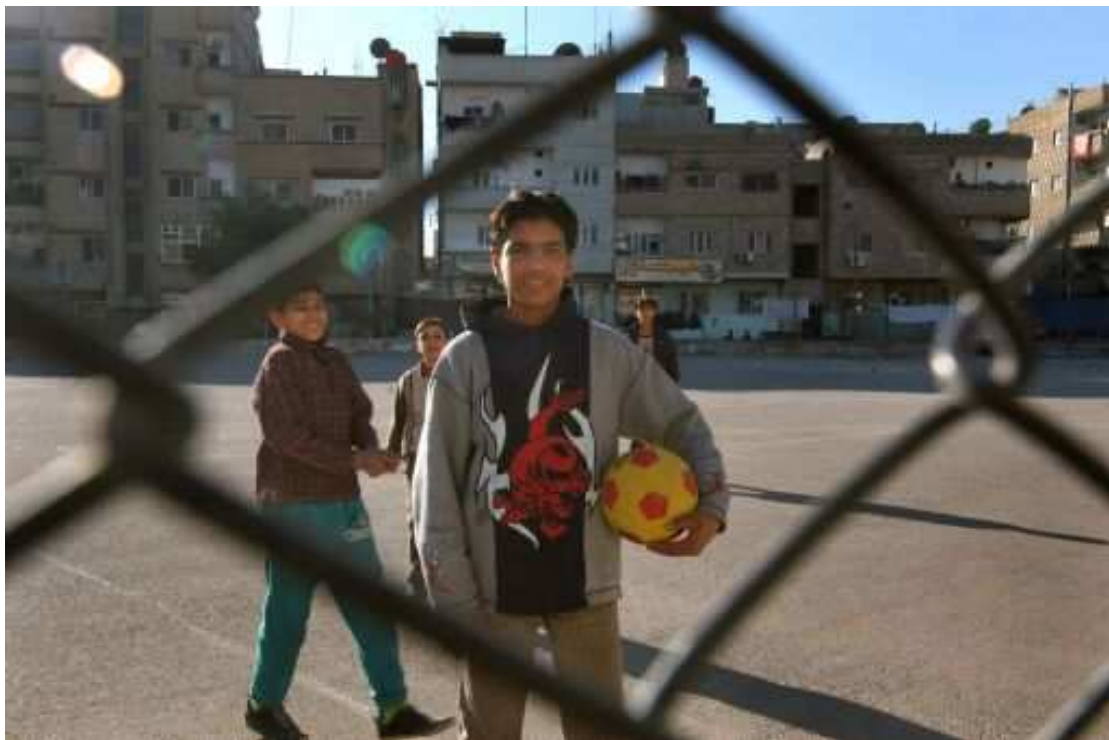
Young Iraqis playing football in a Damascus quarter, Syria © UNHCR/J.Wreford, January 2007

According to UNHCR and Syrian government officials, there are no restrictions preventing Iraqi children from attending schools in Syria. In June 2007 there were reported to be some 32,000 Iraqi children, aged between six and 18, attending public schools and about 1,000 children attending private schools. The total is low considering the estimated 1.4 million Iraqi refugees in Syria and the proportion of these who are likely to be children of school-going age. 22 Of the 33,000, some 30,000