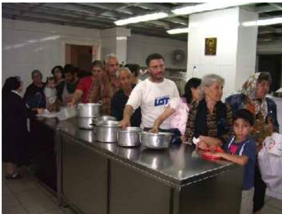
Iraqi families receive a cooked meal from a charity in the Jaramana district of Damascus, Syria, June 2007

When Iraqis cross the border their passports are stamped banning them from working. However, many Iraqis do take paid work illegally and they have become for local employers a cheap workforce. The Syrian authorities are aware of this and tolerate it. They have also taken advantage of the presence of professionals such as medical doctors, teachers and engineers among the Iraqi refugees by issuing them with work permits and allowing them to take jobs in Syria.