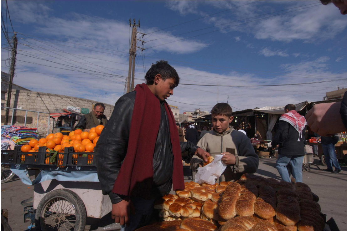
Iraqi refugees try to earn a living in the Sayida Zaynab market in Damascus, January 2007

exception exists for certain professional categories, 14 the overall effect of this unwelcome measure will be a closed border for those needing to flee and obtain protection. Similarly, Amnesty International delegates were informed on their recent visit to the Jordanian capital Amman that the imposition of visa restrictions for Iraqis wishing to enter Jordan is imminent. If so, these new restrictions will further cut off Jordan as a safe haven. Earlier this year the Jordanian authorities introduced a severely restrictive border entry procedure whereby only those with residency permits or invitations for medical or educational purposes have been permitted to pass through the border.