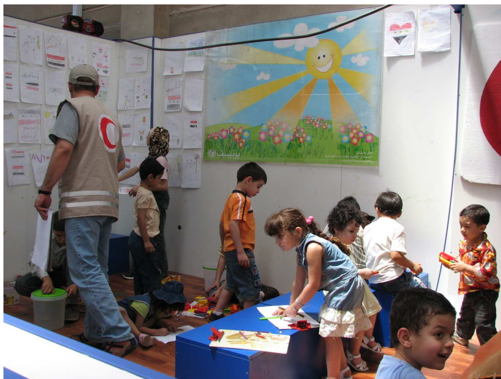
Iraqi refugee children being looked after by a volunteer of the Syrian Arab Red Crescent Society while their families are waiting to be registered with UNHCR in Damascus, Syria, © AI, June 2007

thirds of the 33,000 were attending schools in Greater Damascus. There are 5.3 million children attending schools in Syria nationwide.