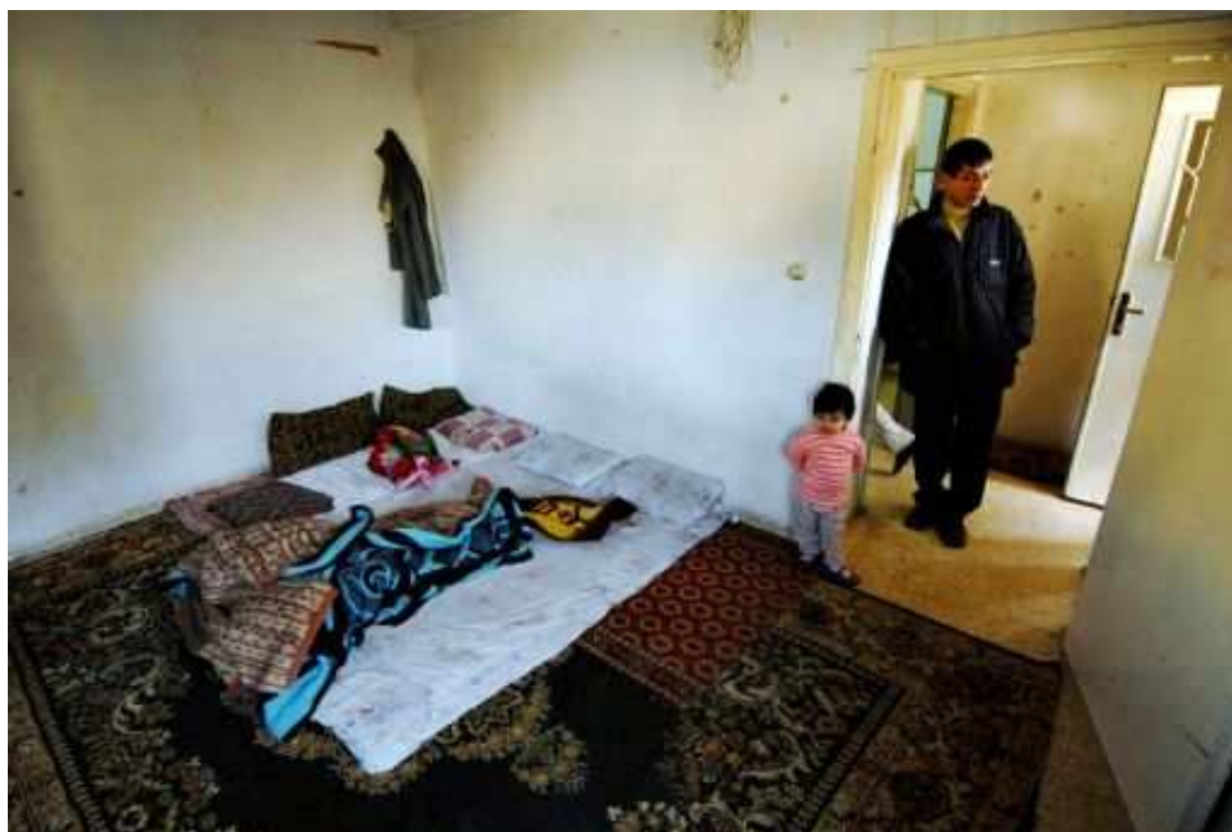
In Amman, most Iraqi refugees live in very basic and often crowded accommodation, © UNHRC/P.Sands, 12 September 2006

Amnesty International delegates were informed by a senior government official during their visit to Amman in September 2007 that the introduction of new visa restrictions, requiring that visas be issued before arrival at the border, was imminent. Such measures are aimed at clarifying the situation for many Iraqis who wish to leave Iraq and are currently selling their belongings to facilitate travel or taking real risks to reach the border, only to be turned away under the current approach to border entry operated by Jordanian officials. At present, only people with Jordanian residency, or certain categories of people such as those needing medical treatment certified by a hospital and those invited to attend seminars or conferences, are permitted entry. Amnesty International delegates were told by government officials that the intended