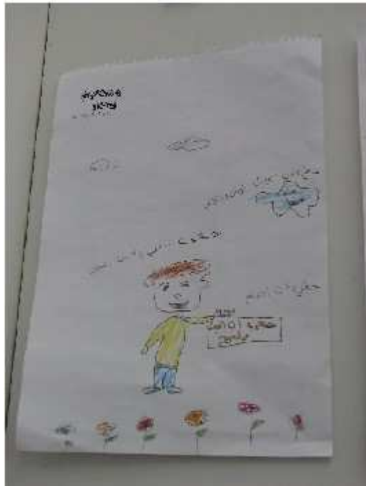
A drawing by an Iraqi child in Damascus with the Arabic writing saying, "I have the right to live in security and peace, I have the right to learn. I have the right to play and have fun." Syria, © AI, June 2007

Interviewed by Amnesty International in June 2007 in Syria