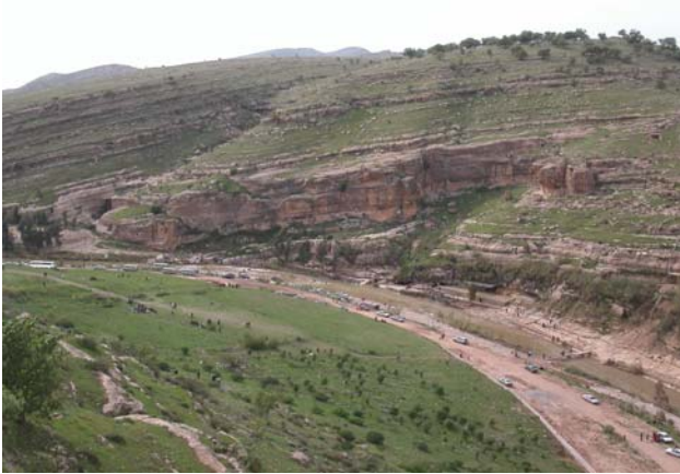
The Khinnis site where ancient Assyrian reliefs and inscriptions grace the hillside. Visible are also Kurdish picnic goers, with their vehicles by the canal below.