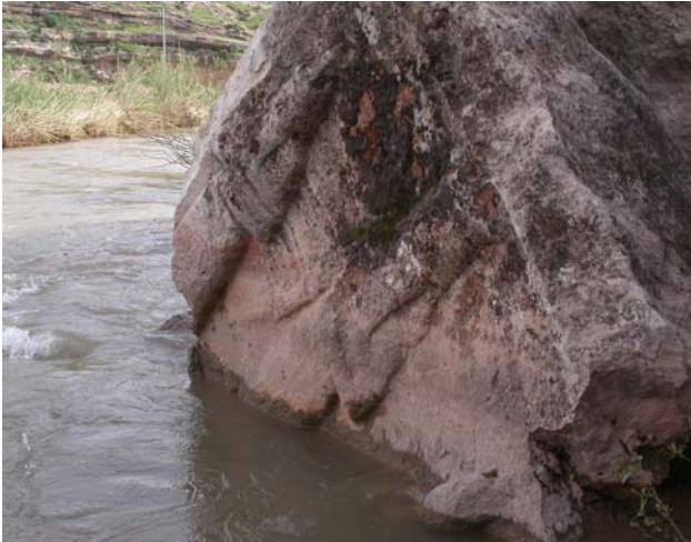
Picture of an ancient Assyrian wall relief outlining royal figures fallen into the river bank due to careless dynamiting. ©Assyrian Academic Society, April 2006