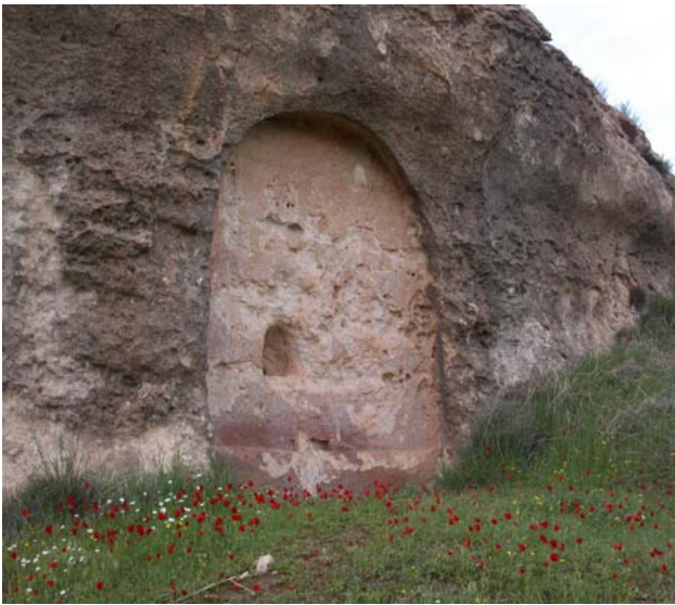
An image of where a wall relief once stood, bullet holes can be seen from constant methodical destruction as a result of the site being used for target practice by Kurdish militia who now comprise the “Kurdistan” Regional Government. ©Assyrian Academic Society, April 2006