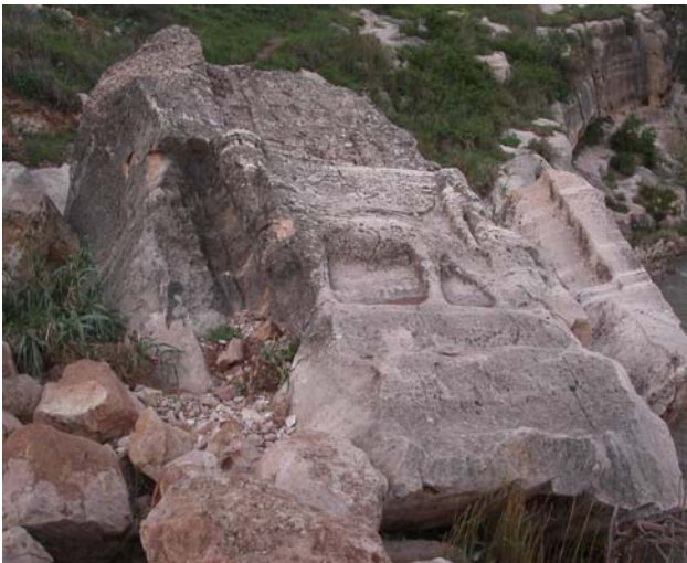
An image of the famous Assyrian lamassu or winged bull dynamited and left in a state of deterioration from years of neglect and recent target practice by Kurdish militia (notice the bullet holes in the relief).