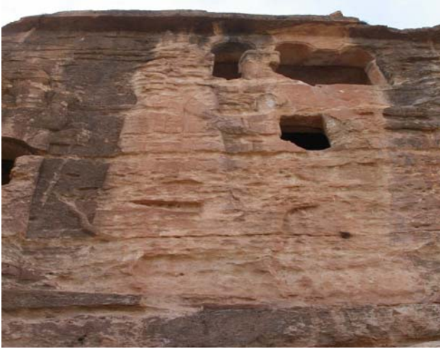
Assyrian wall relief at Khinnis. When examined closely, the figures of ancient Assyrian royalty can be seen.