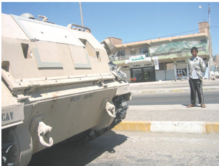
A boy watches a U.S. military vehicle on the main road in al-Falluja in May 2003. U.S. soldiers have used excessive and indiscriminate force there and in other towns.

danger. 372 U.S. forces have failed to conduct investigations into the loss of civilian lives during military operations and thus have made insufficient effort to take steps to reduce civilian casualties.