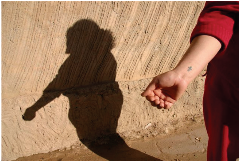
A Christian woman from Baghdad living near Arbil displays her crucifix tattoo. Like hundreds of Christians from the capital, she and her family fled to northern Iraq for safety from threats and attacks.

The most public and coordinated attacks took place on Sunday, August 1, 2004, when insurgents detonated car bombs at five churches, four in Baghdad and one in Mosul, killing eleven people and wounding more than forty. The attacks sparked an exodus of Christians to Syria, Jordan and the Kurdish-controlled north.