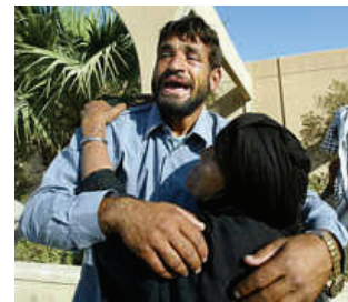
A mother hugs her son outside a morgue in al-Najaf. Two car bombs exploded on August 29, 2003, killing up to eighty-seven people, including Ayatollah Muhammad Baqir al-Hakim.

A second targeted category is Iraqis who work for foreign governments or their armed forces as reconstruction contractors, translators, cleaners, and drivers or in other non-combatant jobs. Some insurgent groups consider Iraqis in these positions to be collaborators, and attacks against them are apparently meant as punishment and as a warning to others. In one case documented in this report, gunmen killed three women as they left a U.S. military base in Mosul where they worked as cleaners, and attacks like this have been frequent across Iraq.