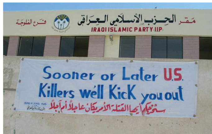
A sign in al-Falluja from May 2003 reveals anger at the United States.