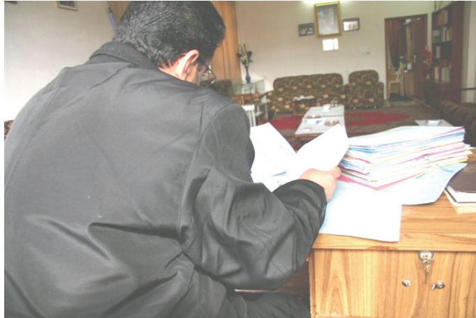
A priest in Sulaimaniya reviews letters from Christians all over Iraq seeking help in relocating to the Kurdish-controlled north to escape threats and attacks.