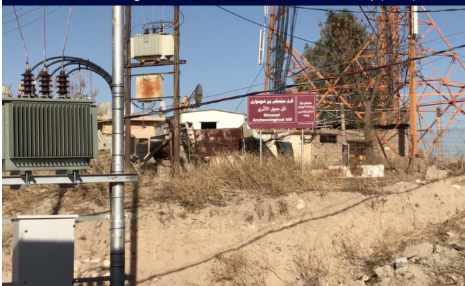
“Simmel Archaeological Hill” in the Dohuk Province of Iraq. (2017)

Many Assyrians feel that the Simele Massacre gravesite in juxtaposition to the massive park built in Erbil honoring former KRG Deputy Prime Minister Sami Abdul Rahman who was killed in a suicide bombing in 2004 and the Halabja Monument and Peace Museum commemorating the tragic 1988 Halabja Massacre is a representation of the inequality between the KRG’s treatment of Kurds and the indigent Assyrians.