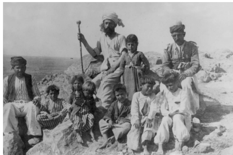
Assyrian refugees who survived the Simele Massacre of 1933 in Iraq pictured in the Khabour Region of Syria. (1935)

Many Assyrians from other parts of Iraq, including the Nineveh Plain and Baghdad, who were not directly