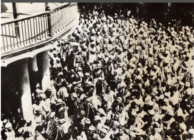
Iraqi Army parade held on August 26, 1933 in the streets of Baghdad to celebrate Iraq’s so-called victory against the Assyrians earlier that month.

On August 18, 1933, Iraqi troops were warmly received in Mosul by its Muslim inhabitants. Arches were erected and decorated with melons pierced by daggers, symbolizing the heads of murdered Assyrians. The Iraqi Crown Prince joined them in the city to award the military and tribal leaders who had participated in the Simele Massacre. The Iraqi Army later paraded in the streets of Baghdad in celebration of its so-called “victories” against the Assyrians. General Bakr Sidqi was promoted. “Sidqi used the murders of these thousands of Assyrian ‘separatists’, as they became popularly termed by the national media, to catapult his career as a military hero.” 7