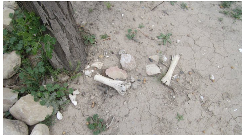
▲ Top: Simele Massacre mass gravesite with human remains exposed. (2016) ▼ Bottom: Remains of Simele Massacre victims lying in open view in Simele.