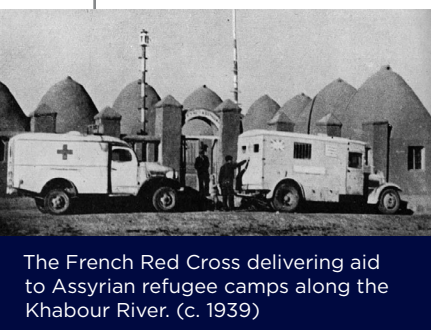
The French Red Cross delivering aid to Assyrian refugee camps along the Khabour River. (c. 1939)

While Assyrian settlement in the region dates back to ancient times, the major modern Assyrian presence in Syria stems back to the aftermath of the Assyrian Genocide (1914-1923) and the Simele Massacre (1933).