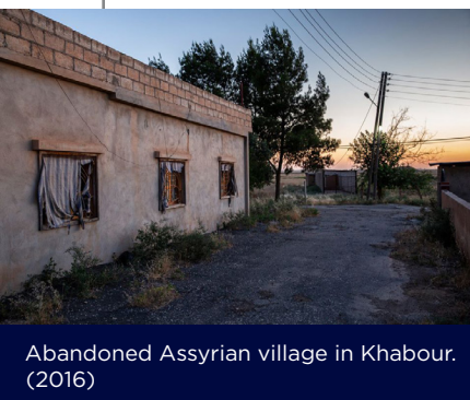
Abandoned Assyrian village in Khabour. (2016)

Many were deeply traumatized and feelings of insecurity, in addition to widespread devastation, prevented the return of locals.