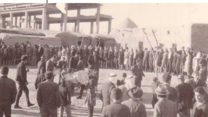
An Assyrian wedding in Tel Hurmiz taking place during the construction of Rabban Pethyon Church. (1966)

In addition to their use as places of worship, Assyrian churches in the Khabour Region were used as archival places and community centers in lieu of spaces designed to promote Assyrian culture and heritage.