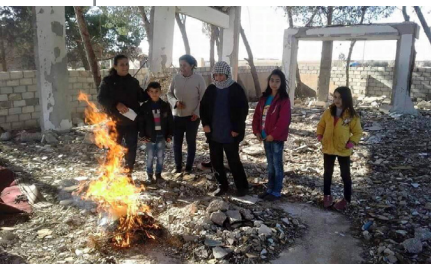
An Assyrian family visits the ruins of Mar Sliwa Church at Tel Talaa on Christmas Day. (2015)

There is limited information available about the effects of displacement on Khabour's Assyrians and the Assyrian people in general. However, assumptions can be drawn based on previous studies. According to one study published by UNESCO which analyzed the impact of displacement on Syrian intangible cultural heritage: