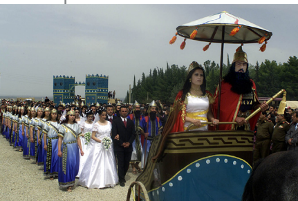
Assyrian New Year festivities in the Khabour Region where celebrants dressed as ancient Assyrian royalty. Collective weddings on the Assyrian New Year were common.

In Khabour, churches were used by local populations as spaces to learn their mother tongue.