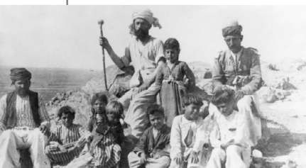
Assyrian refugees who survived the Simele Massacre of 1933 in Iraq pictured in the Khabour Region of Syria. (1935)

Western Assyrians 9 fleeing massacres in the historic Assyrian territories of Mardin, Diyarbakir, Midyat, Tur Abdin, and elsewhere sought refuge in the French-controlled province of Al-Jazira, where they established the city of Qamishli, originally named Beth Zalin ('house of reeds' in Assyrian). Eastern