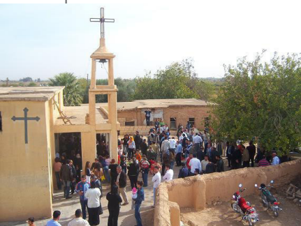
A dokhrana held at Mar Khaninia Church in Tel Sakra. (c. 2005)