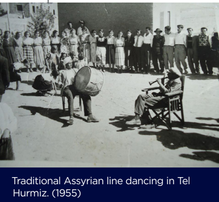
Traditional Assyrian line dancing in Tel Hurmiz. (1955)

However—ethnically and linguistically a distinct people—Syria’s Assyrians were mistreated by the Syrian Government, whose policies imposed the “Arab nature” of Syria.