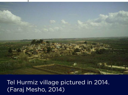
Tel Hurmiz village pictured in 2014.

No comprehensive survey of the Assyrian population in Syria has been done since July 1940, which is when Assyrians first acquired Syrian citizenship and titles to their lands, but estimates of the Assyrian population in Khabour alone was estimated to be as many as 30,000 in the 1990s. 16 In addition to the Assyrian