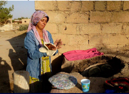
An Assyrian woman in the Khabour Region making bread using a tandoor oven. (2012)

The academic literature on refugees and displacement shows that people displaced by conflict may face violence, physical and psychological suffering, loss of property and livelihoods, and the death and scattering of family members. They may experience a radical separation from their places and communities of origin. All these factors inevitably induce changes in lifestyles and cultural practices. Several studies have also focused on displaced communities over the long term and found that, even in situations of geographic and/or social dislocation, these communities can display cultural resilience. Refugees and internally displaced persons (IDPs) have turned to various forms of cultural expressions that help them live through disasters. Such forms include inter alia rituals of grieving and mourning, collective practices of social bonding and remembrance, and the celebration of birth, marriage and other festive events. Within new environments, the performing arts or crafts skills can furthermore provide a source of livelihood, whereas traditional knowledge may be harnessed for survival.