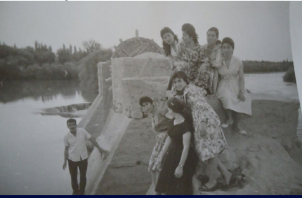
Assyrian women gathered around a Khabour River mill.

Elements of Assyrian heritage must always be viewed in the context of the geographical region in which they were created and the unique experiences of the Assyrians who inhabited the area.