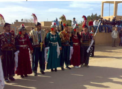
Ashur Dance Group performing at the Assyrian New Year celebration in Khabour. (2010)

Even with some restrictions lifted, event organizers were routinely arrested and interrogated. For example, a man from Tel Nasri who was involved in organizing Assyrian New Year festivities for several years alleged he was arrested on numerous occasions. He claimed he was held for days at a time, during which time he was interrogated and threatened; he said his passport was also confiscated