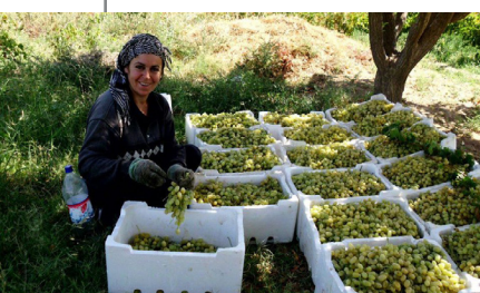
An Assyrian woman harvesting grapes in the Khabour Region. (2012)

An argument can be made that because ICH is embedded in social and cultural practices, representations, sense of belonging and identity, it ‘moves’ with its displaced bearers, who may use it to respond to social, economic, and psychological shocks. In exile, this ‘soft’ form of heritage may be central to the refugees’ collective memory, cultural identity, and resilience. The rupture of the socio-cultural fabric brought about by displacement, however, is likely to entail the dislocation of contexts and channels necessary for ICH expression. Importantly, the social, economic, security, legal, or political context within which people are displaced may, as a side effect, not be conducive for them to express their ICH. In such situations, it is likely that some expressions and practices will be eroded or lost, while communities, groups and individuals, will transform others, which also may start to carry new meaning. 49