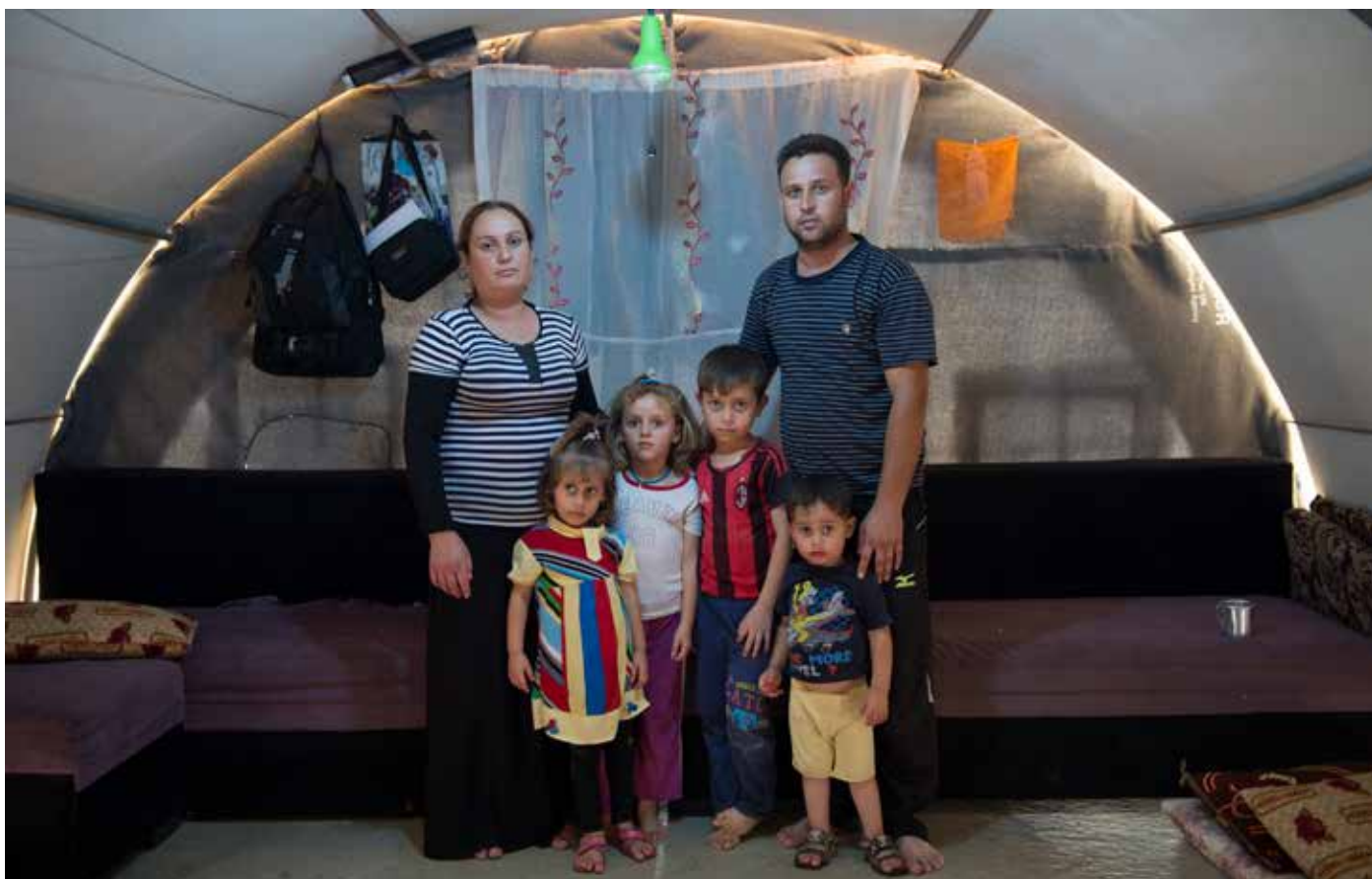
The Kheder family had to flee when IS attacked Sinjar. They now live as IDPs in a camp outside of Dohuk.