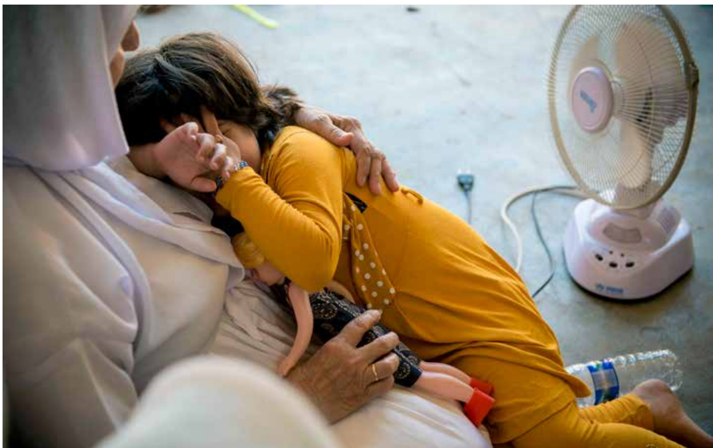
This five years old Yezidi girl has just been released from IS captivity. The extended family is taking care of her and her brother. There is no information about their parents. They do not remember their mother tongue, they only speak the language of their captors – Arabic.

where IS and other major Sunni Arab armed groups have attempted to capture land from the regime, particularly in the province and city of Homs, have been disproportionately affected by attempts to drive them away. IS has directly targeted minorities in Syria for extermination, as in Iraq. An episode that indicates IS's intent to exterminate took place in Al-Taliliyah (Al-Hasakah, Syria) on 29 May 2014, when IS attacked a village that used to contain a Yezidi community. The village had been taken over by IDPs, most of whom were women and children from Al-Safira near Aleppo. IS fighters – mainly foreign fighters who did not speak Arabic and so could not understand the protestations of those they were killing – believed their victims to be Yezidi Kurds. The executions halted when an Iraqi IS fighter arrived and confirmed to his fellow fighters that the civilians were Sunni Arabs. 98