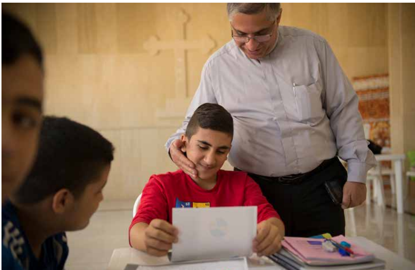
An Assyrian Church outside of Beirut provides a safe space and education for refugee children.