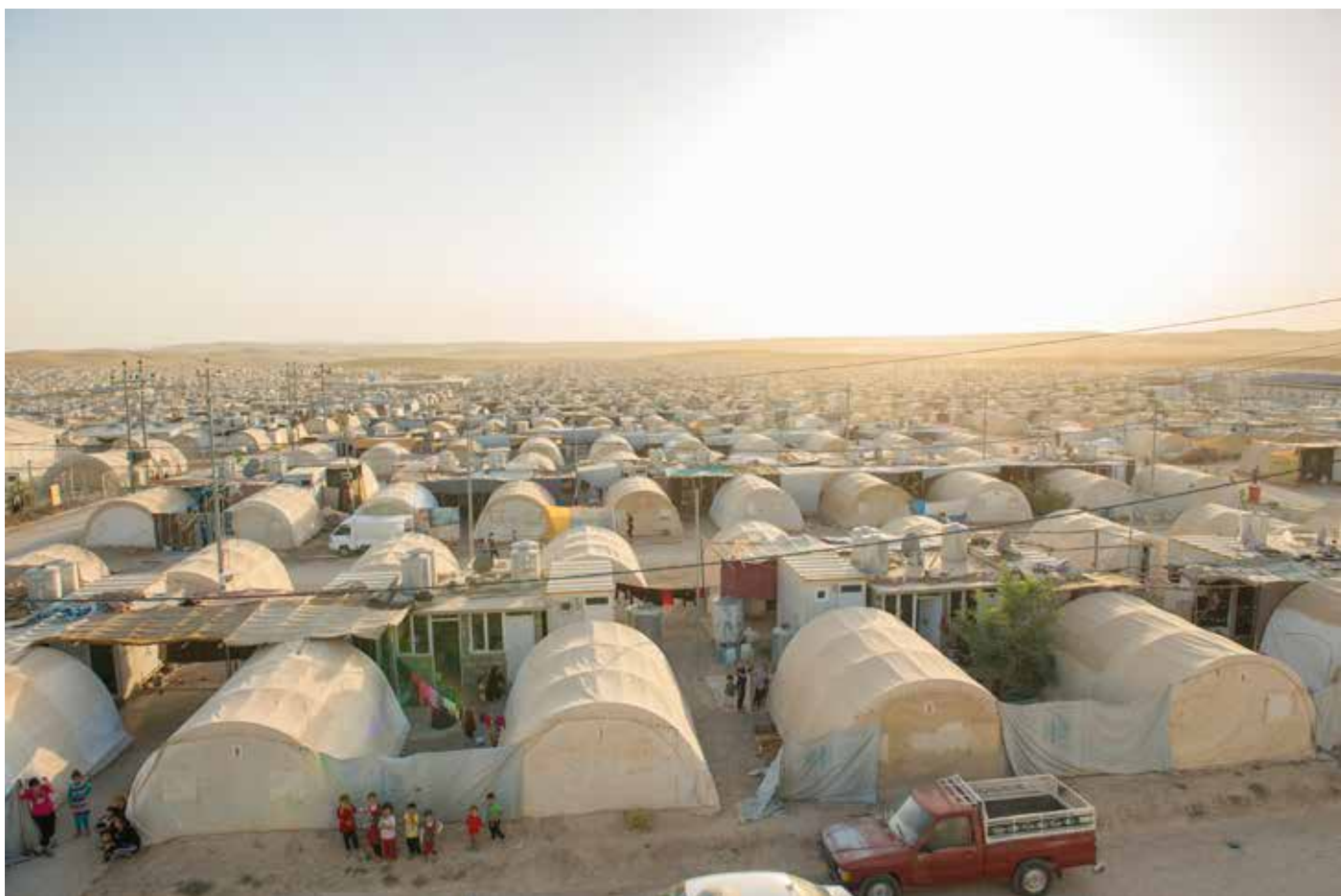
Nearly 30,000 people, mostly Yazidis live in the Kabarto I/II camps in the Kurdistan region. In almost each tent you can hear stories of persecution and escape.