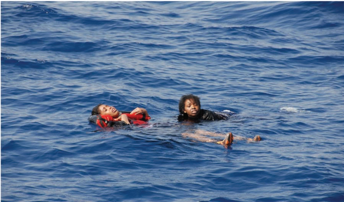
Migrants being rescued by the Hellenic Coast Guard in the Aegean Sea.

having 1,170 kilometers of porous land borders and 18,400 kilometers of coastline, including islands in close proximity to Turkey, Greek police and Coast Guard authorities are zealous in their efforts to prevent irregular entry. In 2007, Greek police recorded 112,369 arrests for illegal entry or presence. However, Human Rights Watch believes this is the tip of the iceberg. Many, perhaps most, of the apprehensions in the border region are not recorded at all.