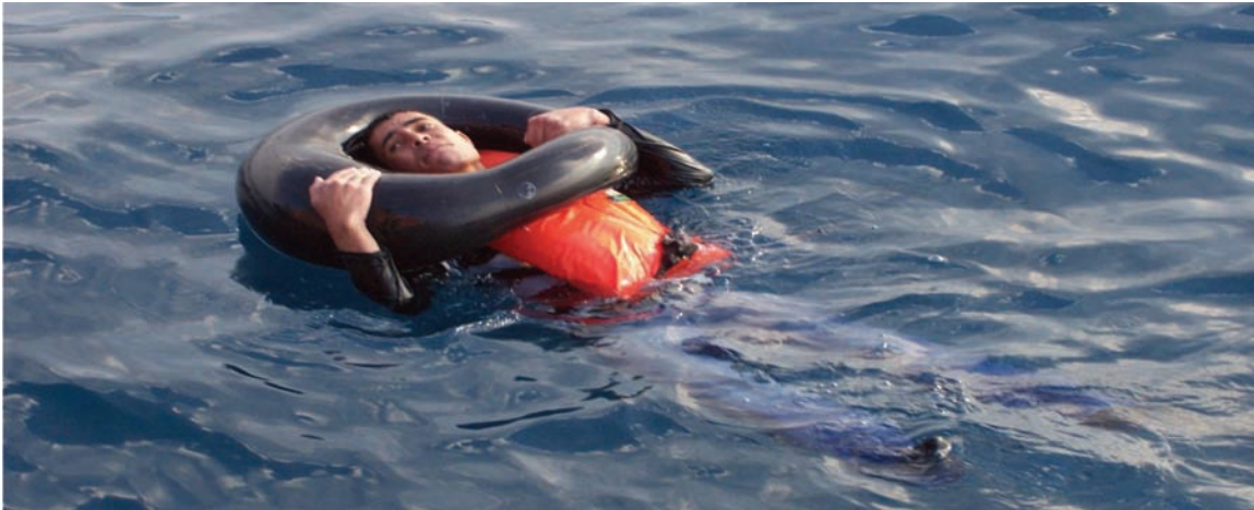
Migrant being rescued by the Hellenic Coast Guard in the Aegean Sea.

Although Human Rights Watch interviewed five migrants who were rescued and brought ashore by the Greek Coast Guard (some, but not all of those rescued also said that they were beaten or threatened with being shot), 10 other migrants told Human Rights Watch about uniformed guardsmen pushing them back into Turkish waters, puncturing their inflatable boats, as well as beating and robbing them. Another two migrants who the Greek Coast Guard returned to Turkish waters said that they had disabled their own boat.