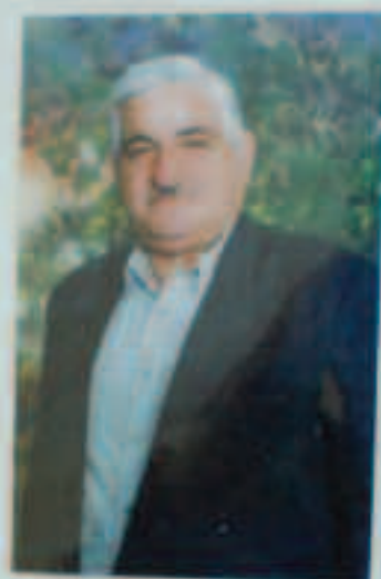
15cm x 22cm