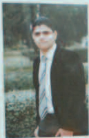
15cm x 22cm