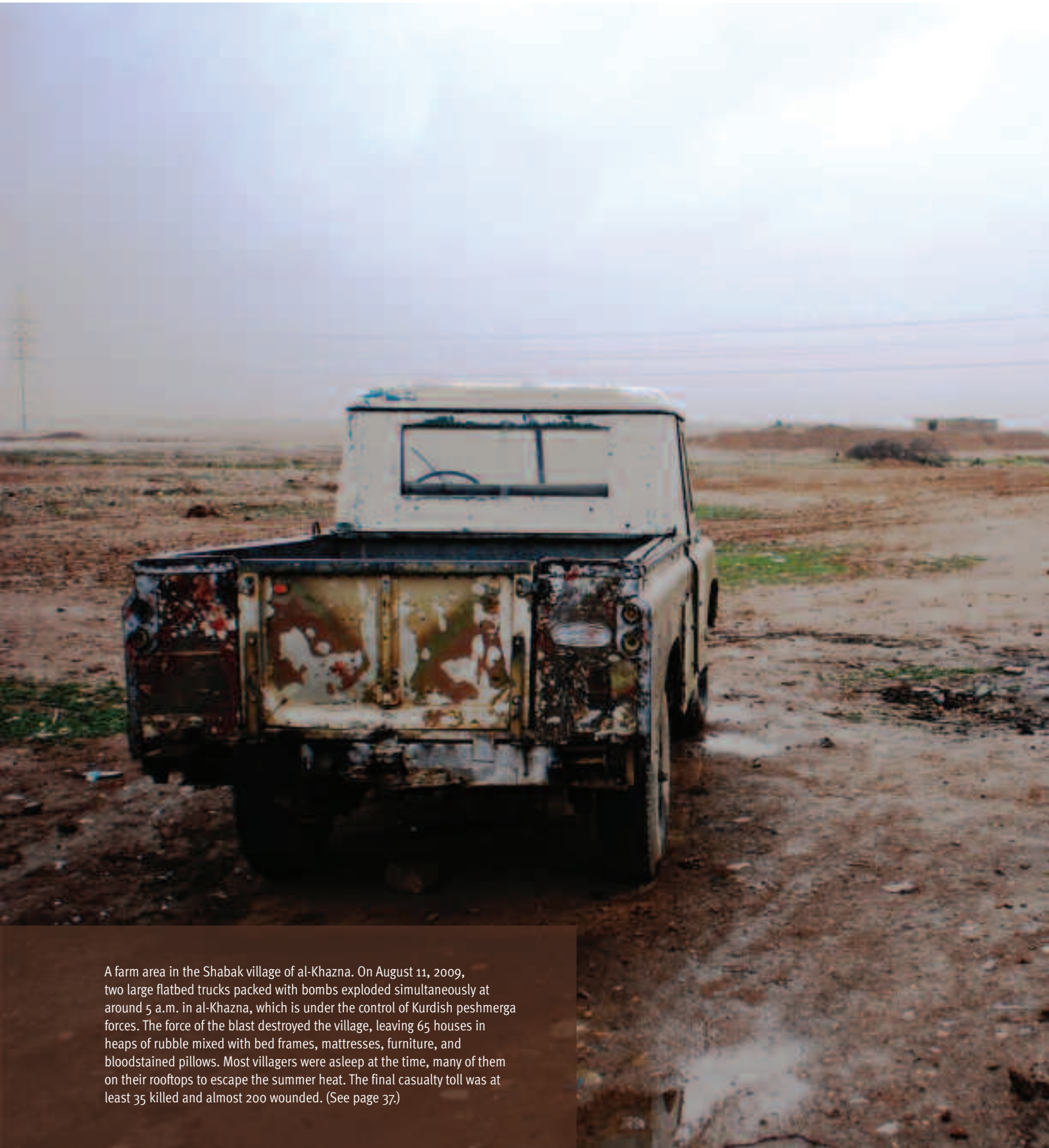
A farm area in the Shabak village of al-Khazna. On August 11, 2009, two large flatbed trucks packed with bombs exploded simultaneously at around 5 a.m. in al-Khazna, which is under the control of Kurdish peshmerga forces. The force of the blast destroyed the village, leaving 65 houses in heaps of rubble mixed with bed frames, mattresses, furniture, and bloodstained pillows. Most villagers were asleep at the time, many of them on their rooftops to escape the summer heat. The final casualty toll was at least 35 killed and almost 200 wounded. (See page 37)